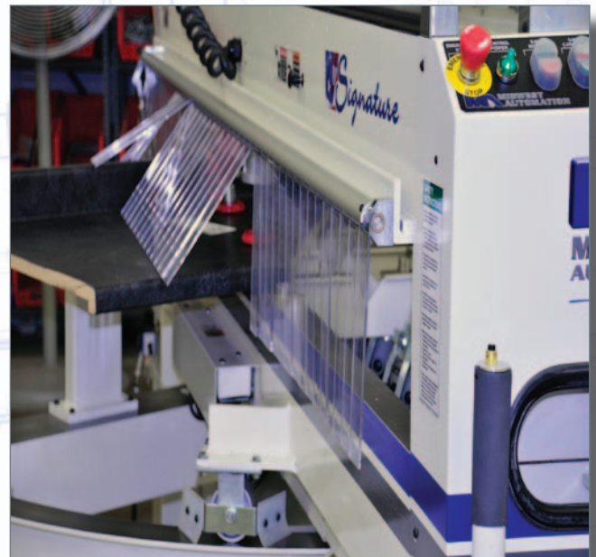
Side Shield from Front of Machine with Countertop