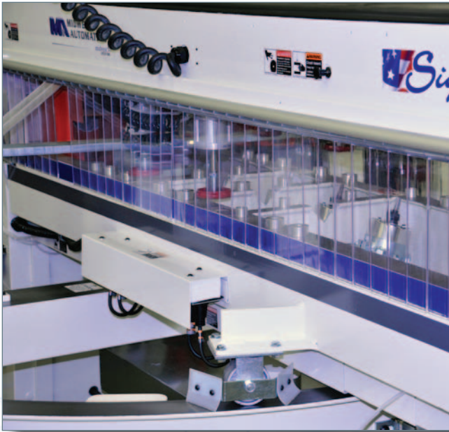
Side Shield in Down Position