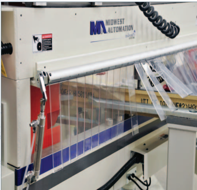
Side Shield from Rear of Machine with Countertop