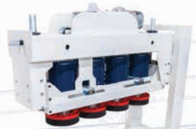
TOP BRUSH HEAD (TB)