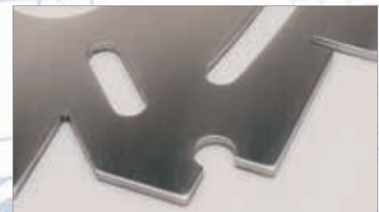
METAL PART AFTER