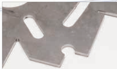
METAL PART BEFORE